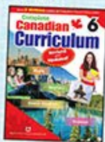
Complete Canadian Curriculum