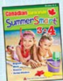
Canadian Curriculum SummerSmart