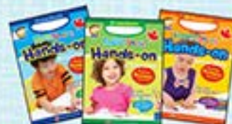
Preschool Smart Hands-on Activities