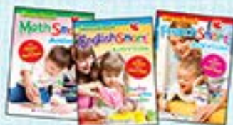
Preschool Smart Activities