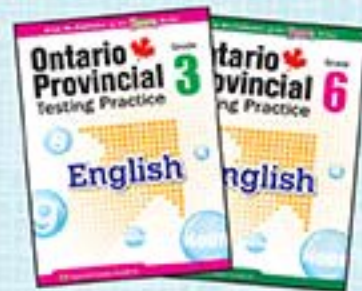
Ontario Provincial Testing Practice English (Grades 3 and 6)

All Children's Workbooks and Activity Books up to