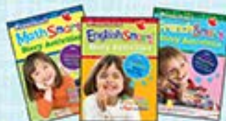
Preschool Smart Story Activities