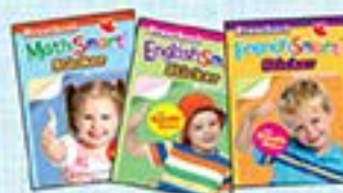
Preschool Smart Sticker Activities