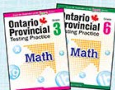
Ontario Provincial Testing Practice Math (Grades 3 and 6)